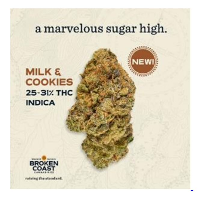
New BC Bud by Broken Coast Cannabis